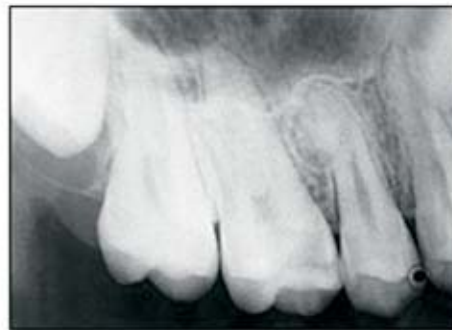
Figure 4. Periapical radiograph showing the presence of a supernumerary premolar tooth and a supernumerary molar tooth in right maxilla.