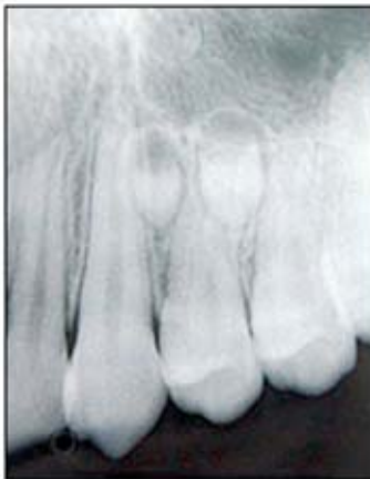
Figure 5. Periapical radiograph showing the presence of supernumerary teeth in the left maxilla.