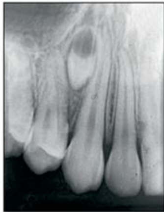
Figure 3. Periapical radiograph showing the presence of a supernumerary tooth located between the roots of the maxillary right first premolar and the canine.