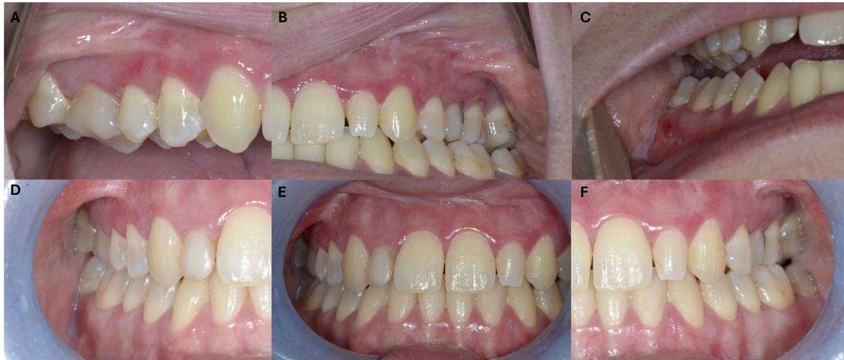
Fig. 1. (A) Generalized gingival inflammation accompanied by erosions, blisters, and their remnants affecting gingiva, right side. (B) Generalized gingival inflammation accompanied by erosions, blisters, and their remnants affecting gingiva, left side. (C) Generalized gingival inflammation accompanied by erosions, blisters, and their remnants affecting both the gingiva and lining mucosa, right side. (D) Clinical pictures taken following a 3-week interruption of etanercept treatment, right side. (E) Clinical pictures taken following a 3-week interruption of etanercept treatment, midline. (F) Clinical pictures taken following a 3-week interruption of etanercept treatment, left side.

symptoms. Since December 2023, axial spondylarthritis treatment was switched to certolizumab pegol (Cimzia), an anti-TNF- \alpha administered twice a month; the switch did not prevent lesions from developing but resulted in less frequent manifestations.