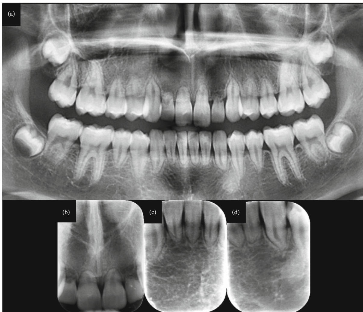
FIGURE 1: Initial radiographic examination of SRA (age of patient: 11 years and 9 months). (a) Panoramic radiography. (b) Periapical radiograph of the maxillary incisors. (c) and (d) Periapical radiographs of the lower incisors. Notice the abnormally short roots with round apices of all teeth except first molars. Mandibular first premolars also have short roots, but their root to crown ratio is bigger than 1:1. Maxillary lateral incisors present intense root resorption and apical radiolucency.