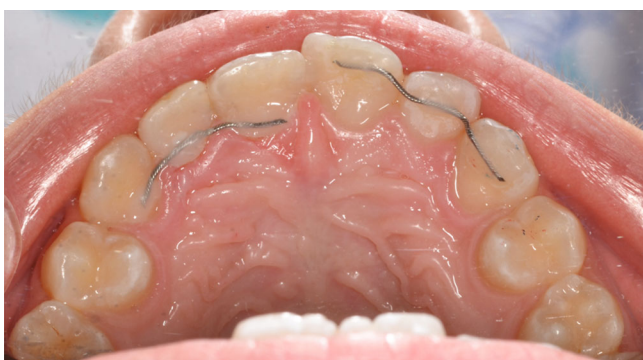
FIGURE 2: Passive splinting of maxillary lateral incisors to their adjacent teeth. Two separate palatally bonded wires were used.

the dose of treatment, the more severe the developmental anomalies of the roots and the teeth in general [16, 17]. Patients with dentin dysplasia type I (DD-I) also present