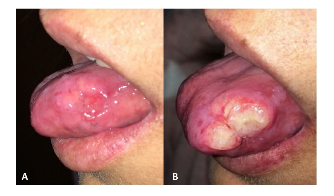
Fig. 3 UPN 333 showed a painful swelling of the left lingual margin (A). The COVID-19 pandemic determined a 5-month diagnostic delay, with a consistent growth in size of the tumor (B)

The higher turnover rate creates a statistical increase in the possibility of replicative error, which is itself more likely in FA patients. Generally speaking, difficult oral care and extensive dental caries are frequent in patients with GvHD. So, the tongue is often subjected to traumatic frictional damage on