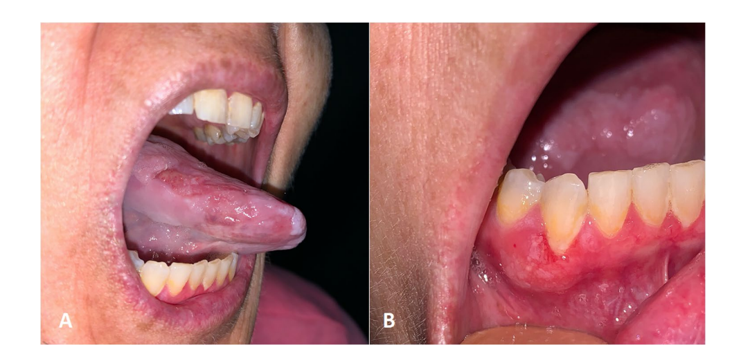
Fig. 2 UPN 230 presented to the outpatient clinic with a painful swelling of the right side of the tongue (A). A concomitant ulceration of the adherent gingiva in the fourth quadrant was observed as well during the clinical examination (B). Bioptic examination of the lesions documented a squamous cell carcinoma in both cases

UPN 230 She presented to the outpatient clinic with a painful swelling of the right lingual margin. During the clinical examination, a concomitant ulceration of the adherent gingiva in the fourth quadrant was observed (Fig. 2). A prompt biopsy of both lesions led to the diagnosis of two moderately differentiated SCC. Preoperative radiological examinations showed no cervical nor distant metastasis. The patient underwent partial tongue resection and partial mandibulectomy, with clear surgical margins. The mandibular defect was contextually reconstructed with a right facial artery musculo-mucosal (FAMM) flap. The patient is now