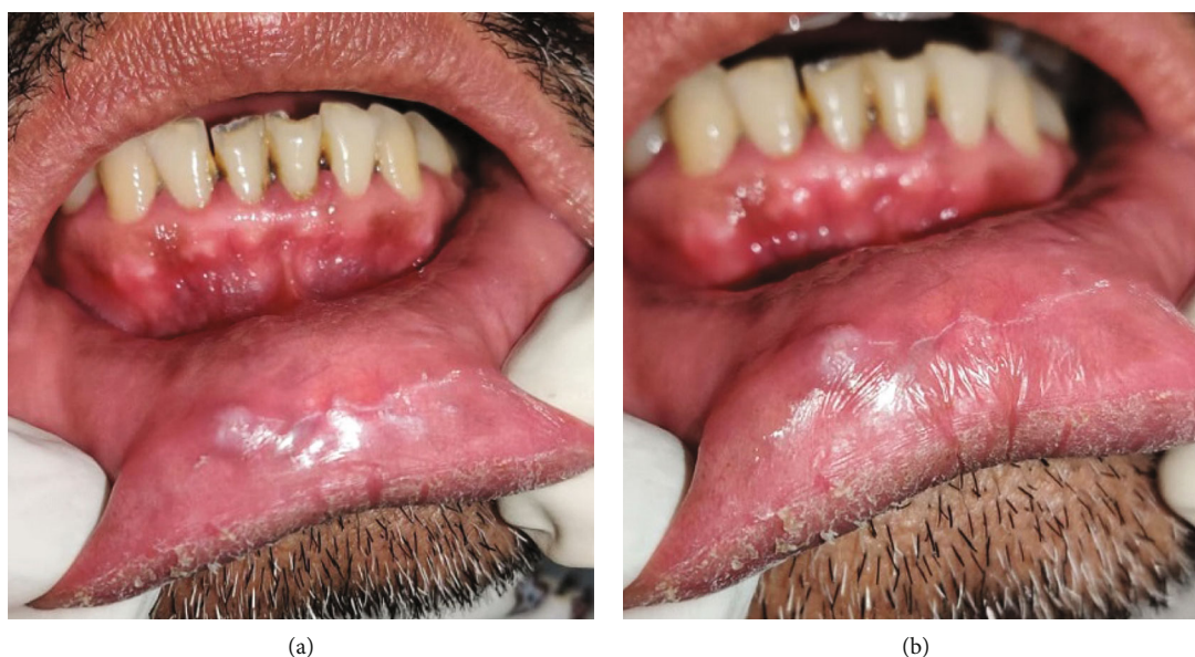
FIGURE 1: (a, b) Solitary, well-circumscribed submucosal mass in the lower lip, with an adjacent bluish-white swelling depicting a mucocele.