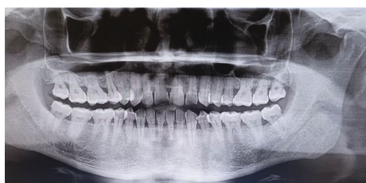
FIGURE 2: OPG demonstrating an ill-defined periapical pathology with #31.

Neurofibroma (NF) is a nerve sheath neoplasm, manifesting as a localized lesion or as a component of the diffuse neurofibromatosis syndrome. However, solitary NF is an extremely unusual occurrence in the oral cavity (6% occurrence) and infrequently affects the lower lip [23].