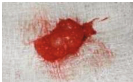
FIGURE 4: Gross excised specimen was suggestive of a firm nodular mass.

channels lined by endothelial cells within the papillary and reticular layers of the lamina propria. The large dilated lymphatics just are filled with lymph and infiltrated with inflammatory cell infiltrates, predominantly lymphocytes, neutrophils, and plasma cells. The histopathological features were in coherence with a diagnosis of lymphangioma (Figure 5). However, the patient was lost for further follow-up.