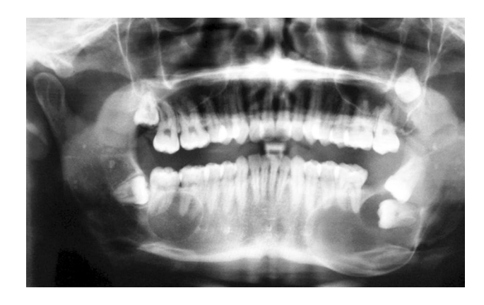
Fig. 1 OPT from case 1 showing bilateral mandibular lesions and a cystic lesion associated with the displaced upper left 8 (UL8)

the right body of the mandible, a spherical radiolucency was noted overlying the roots of the lower right first and second molars. In the left body of the mandible, there was a larger radiolucent lesion with evidence of cortical expansion and displacement of the lower left second and third molars. A less well-defined radiolucency was seen in the left posterior maxilla. This lesion appeared to be multilocular and had inverted the third molar tooth and displaced it upwards into the posterior wall of the antrum.