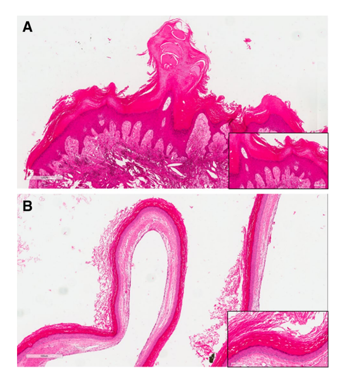
Fig. 2 Histological appearance of the cysts in case 1. a Cyst from the left angle of mandible showing prominent orthokeratosis and a mild verrucous appearance, H&E stain, original magnification \times 4 . Insert bottom right, H&E stain, original magnification \times 10 . b Cyst from the right mandible showing prominent orthokeratosis, H&E stain, original magnification \times 4 . Insert bottom right, H&E stain, original magnification \times 4 . Insert bottom right, H&E stain, original magnification \times 4 . Insert bottom right, H&E stain, original magnification \times 4 . Insert bottom right, H&E stain, original magnification \times 4 .

A 20-year male presented for extraction of a partially erupted and disto-angular positioned upper right second molar. On routine pre-operative radiographs, it was noted that both the left and right upper third molar teeth were impacted, displaced and associated with large, expansile radiolucencies (Fig. 3a, b). A Cone Beam CT (CBCT) revealed extensive