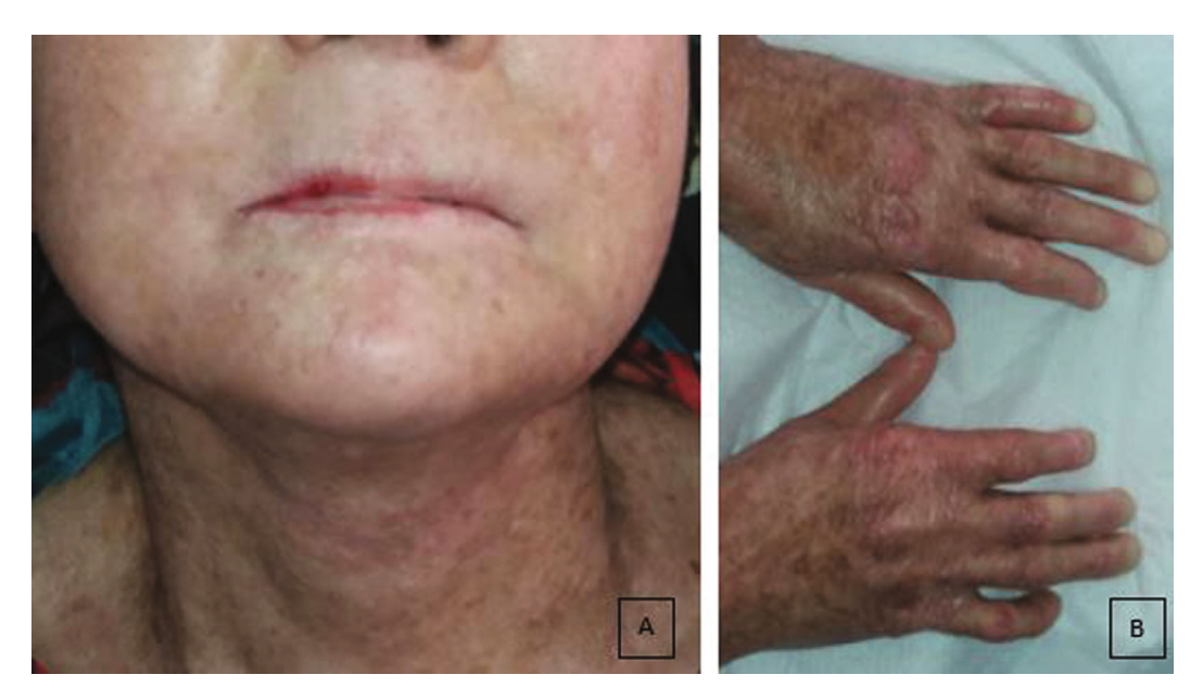
FIGURE 1: (a) The image showing multiple hypo- and hyperpigmented macules, prominent poikilodermatous changes, xerosis, alopecia, and atrophy of the skin. (b) The image showing cigarette paper-like wrinkling on the dorsum of the feet and hands. Atrophy and adhesions were detected in the fingers.