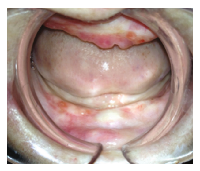
FIGURE 4: The image showing six-week postoperative healing after medicine treatment and gingivectomy.

KS has various clinical symptoms such as acral skin blisters, progressive poikiloderma [1], alopecia, nail dystrophy, acral hyperkeratosis [7], contractures and webbing of toes and fingers [6], photosensitivity [1], and actinic changes [9]. In addition, oral symptoms are very common in this disorder. It was reported that oral manifestations often include severe periodontitis which begins with permanent teeth eruption and progresses rapidly, poor dentition with premature loss of teeth, erosive areas in the labial and buccal mucosa and gingiva, spontaneous bleeding, desquamative gingivitis, angular cheilitis, leukokeratosis of the lips, caries, halitosis, and xerostomia [13]. Clinical and oral manifestations of the present case were similar to those reported in previous studies.