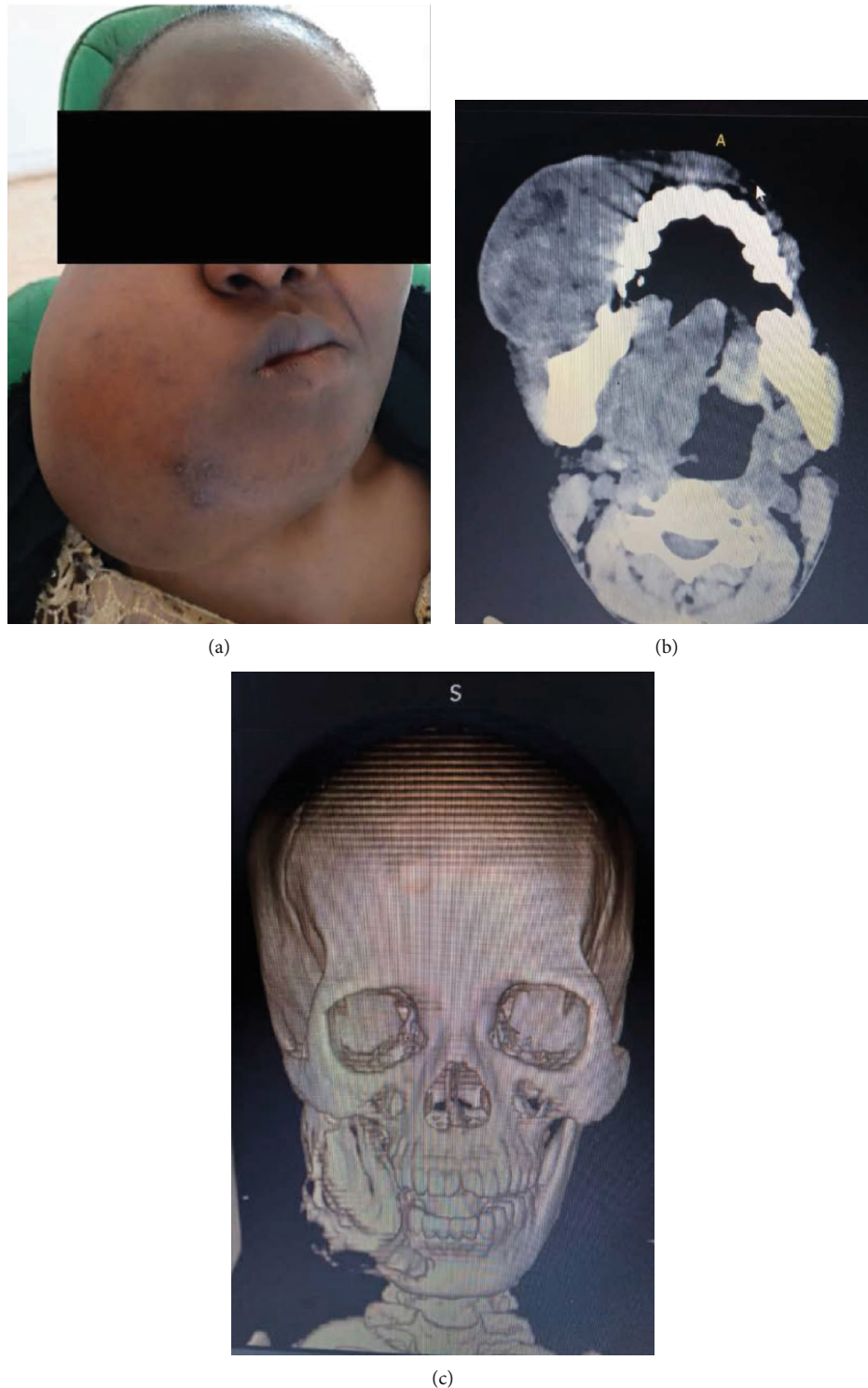
FIGURE 1: Clinical image of a 43-year-old female patient diagnosed with a EWSR1 -rearranged clear cell odontogenic carcinoma of the mandible (a), CT scan axial view (b), and 3D-reformatted CT scan showing an osteolytic destructive mass in the mandible with thinning and perforation of the cortical border of the mandible (c).