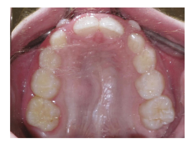
FIGURE 2: Intraoral photograph of the hard palate. Subtle swelling of the right hard palate with normal overlaying mucosa.

2.4. Follow-Up and Outcome. Four months postsurgery, the patient showed adequate healing. Eighteen months postsurgery, there were no clinical signs of recurrence.