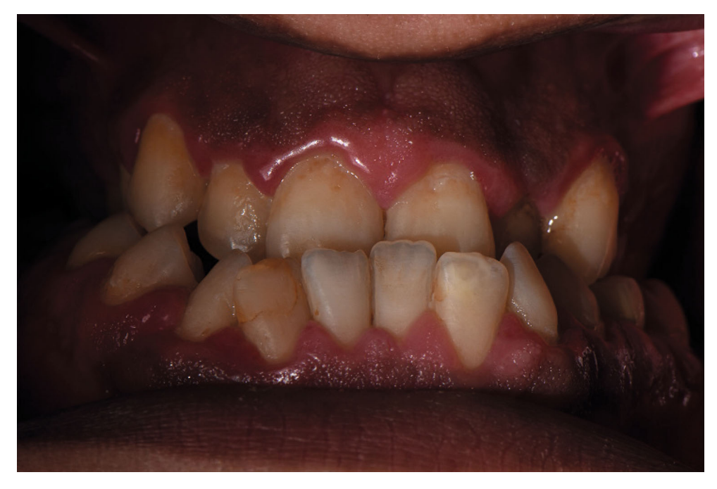
FIGURE 2: An intraoral anterior view of the patient's anterior cross bite.