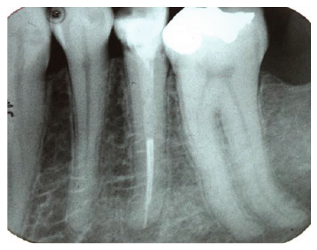
FIGURE 6: PA X-ray of the long root of the teeth.