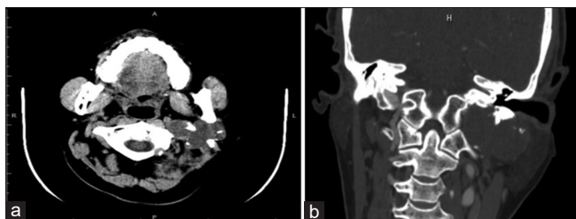
Figure 1: CT Scan showed an irregular lobular mass on the left parotid gland involving deep lobe with clear boundary and showing compression of the left internal jugular vein without cervical lymph nodes enlargement (a), The coronal incidence demonstrating a heterogeneous soft-tissue mass extended upon to the left temporal bone, and the boundary was not a rough (b)