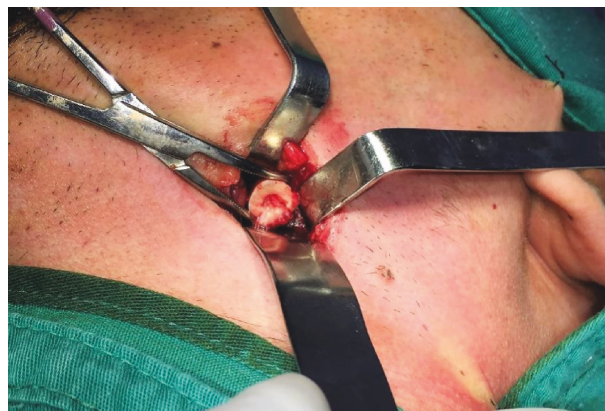
FIGURE 2: Removal of dental element by extraoral access.

Surgeon dentists who perform third molar extractions should consider the local characteristics of the dental element in order to evaluate the level of difficulty the surgical procedure might present. These characteristics include level of impaction, root format, dental inclination, and bone density [4, 9].