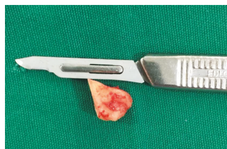
FIGURE 3: Third molar removed.

Bimanual examination can help finding the fragment location, associated to radiograph and tomography images, seeking for the exact local, especially in cases of lower tooth displacement. The advantages of external pressure include avoiding displacement of the fragment, elevation of the mouth floor, and palpation of the area. However, this approach is not recommended if patients present edema or obesity [1]. In case displacement of a dental element into facial spaces occurs, careful thinking should indicate the management procedures to be adopted. Attempts of immediate removal with lack of skills or lack of anatomic and surgical knowledge may worsen the condition by deepening the fragment or moving it into adjacent spaces [5].