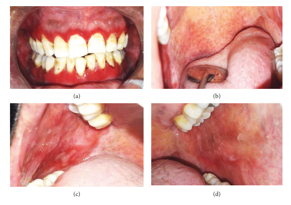
Figure 2: Vulvo-vaginal-gingival syndrome: oral lesions (patient 5). (a) Erosive gingivitis. (b) Soft palate involvement with extension to esophageal region. (c), (d) Erosive lesions of the inner surface of the cheeks.