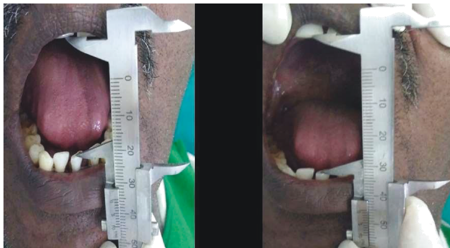
FIGURE 1: Pre and post appliance therapy.

bearing on oral hygiene, speech, mastication, and possibly swallowing. Moreover, the risk for its malignant transformation is found to be varied from 7% to 30% [4].