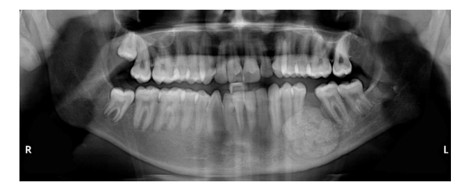
Figure 2 An orthopantomogram showing well-defined radiopacity with a radiolucent rim showing a central radiopaque nidus surrounded by a radiolucent border.

An orthopantomogram scan revealed a well-defined radiopacity in the mandible with respect to regions 33, 34, 35, and 37 surrounded by a radiolucent rim (Fig. 2). The radiopaque mass consisted of a radiopaque nidus measuring 1.5 cm in diameter surrounded by the formation of subperiosteal new bone. The whole mass measured 3.5 cm (maximum) in diameter. No changes were observed with respect to the inferior border of the mandible. A mandibular crosssectional occlusal radiograph revealed a well-defined radiopacity in the mandible extending from region 34 to 37