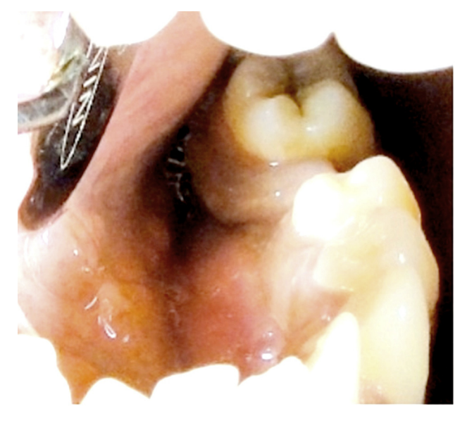
Figure 1 A photograph showing lingual cortex expansion in the 34–35 region.

was from the left corner of the mouth to the left angle of the mandible. The overlying skin was normal with no local rise in temperature. One left submandibular lymph node was palpable, slightly mobile, and tender. Results of an intraoral examination revealed a localized, bony hard swelling in the region of the mandibular left first molar. Buccolingually, the swelling was 3 cm in diameter. Mesiodistally, it extended from the mandibular left first premolar region to the first molar region (Fig. 1). The involved teeth were neither tender on percussion nor mobile. There was no obliteration of the buccal vestibule. From this clinical picture, a differential diagnosis of infected residual cyst, osteomyelitis, and benign bone neoplasm were taken into consideration.