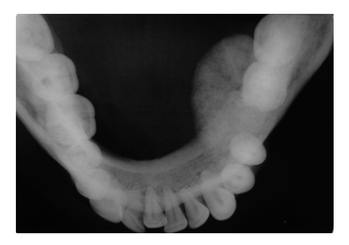
Figure 3 A mandibular occlusal radiograph showing the radiopaque lesion causing expansion of the lingual cortex.

causing an expansion of the lingual cortex (Fig. 3). Based on the results of the radiographic analysis, osteoid osteoma, cementoblastoma, complex odontoma, ossifying fibroma, osteoblastoma, and idiopathic osteosclerosis were considered in the differential diagnosis. Surgical excision of the lesion was done as a part of the treatment. The lesional tissue was sent for histopathological analysis. The postoperative healing was uneventful and the patient was followed-up for a period of 6 months. The pain was completely relieved.