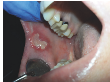
FIGURE 1: The first presentation of the lesion, after topical corticosteroids applications.

The dye was applied on the entire surface of the lesion beyond the margins and even encroaching on healthy tissue. The light diode was then turned on with a wavelength of