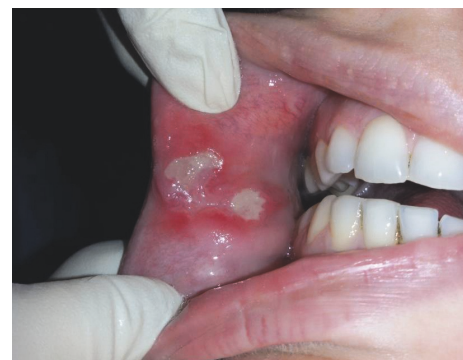
FIGURE 2: The lesion after light diode applications (wavelength of 630 nm with cycles from 30 seconds, 10 consecutive times).

630 nm with cycles from 30 seconds, 10 consecutive times, using a long piped tip and performing circular movements of about 0.5 cm above it. At the end of the 10 applications, the dye was completely removed with a gauze and the patient performed a final rinsing with water. After a few days, a curious phenomenon happened: healing of Afta Major starting from the center, which was almost completely healed towards the borders of the lesion (Figure 2). The patient reported some relief a few hours after the appointment. After a week the wound had healed completely (Figure 3).