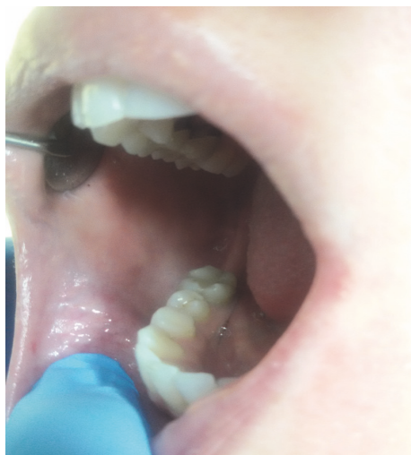
FIGURE 3: The lesion completely healed after a week.