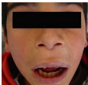
Fig. 1. Extra-oral swelling of the left corner of the upper lip was present.