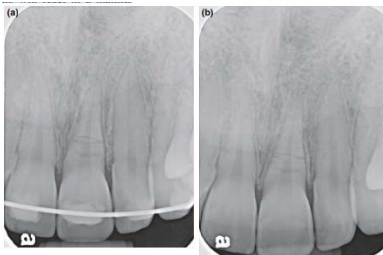
Fig. 2 Root fracture of the left central incisor of a 14-year-old girl with subluxation of the coronal fragment. (a) Immediately after stabilization with a splint. (b) Healing by calcification is evident at 8 months. The pulp remains responsive to the pulp sensibility testing.