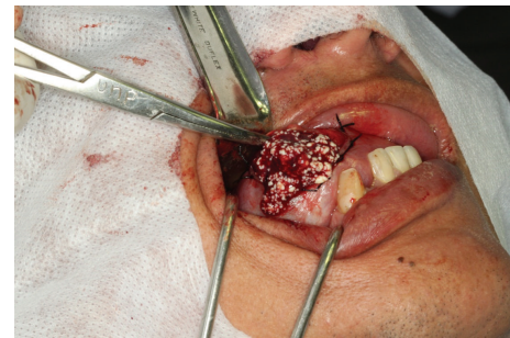
FIGURE 3: Aspect of contents of lesion during surgical excision: material white, friable, and compatible with orthokeratin.

EC have different diagnosis such as infectious lesions of the salivary glands, ranula, dermoid cyst, lipoma, lingual thyroid, and thyroglossal duct cyst [3, 4, 12, 14–16]. In the present case the hypothesis of diagnosis was ranula, dermoid cyst, and EC (Figure 1). The patient reported swallowing and breathing difficulty, probably occasioned for posterior expansion of the lesion in submandibular space.