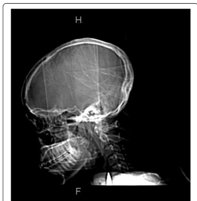
Figure 4 Computed tomography scan of the head and neck. The scan shows a cephalad shift of the bullet to lie partially anterior to the fifth cervical vertebra. There is also a comminuted fracture of the angle and ramus of the right mandible. The section is through the median sagittal plane.

We were faced with a scenario of a GSI to the right side of her head. Given the distance of about 70m, we expected substantial injury; a GSI to the head is often immediately fatal. It was a penetrating type of injury, although avulsion per se was also possible [4]; a 6cm-long wound. What is