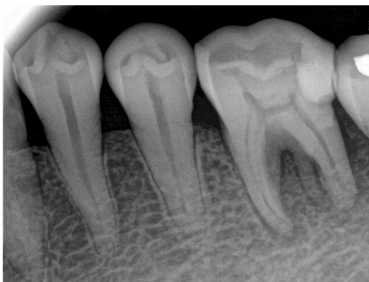
Figure 4 Root-like enamel pearl.

between 1.1 and 9.7% [3]. Enamel pearls are not common in teeth with a single root, although there are rare reports of them occurring on the roots of premolars, canines and incisors [4-6]. It is generally accepted that enamel pearls are usually found adherent to the external root surface of the tooth, but on rare occasions they may be detected within the dentin [7]. They vary in size, ranging from 0.3mm to 4mm in diameter [8]. But in this case report, the enamel pearl in our patient was unusually large, 1.8mm wide and 8mm long.