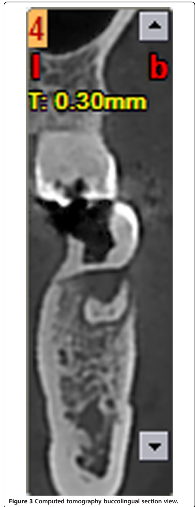
Figure 3 Computed tomography buccolingual section view.