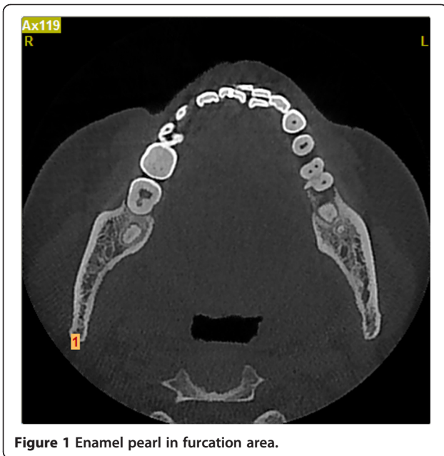
Figure 1 Enamel pearl in furcation area.

Subsequently, she was referred to the restorative department for final restoration. Three months later, she had no symptoms.