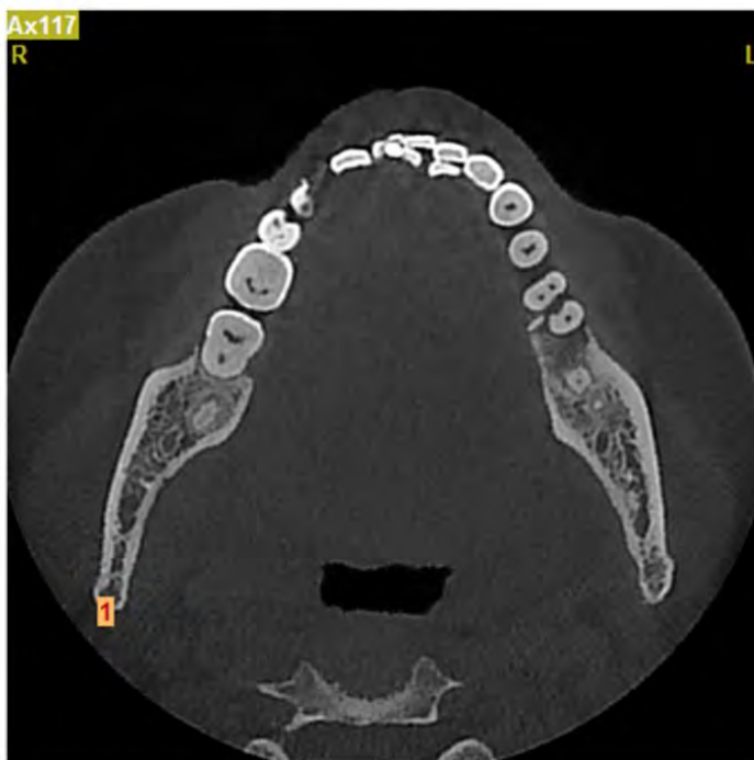
Figure 2 Computed tomography horizontal section view.