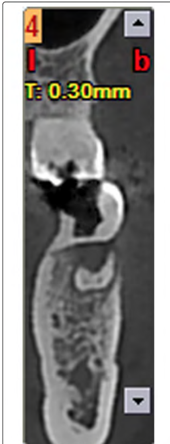
Figure 3 Computed tomography buccolingual section view.