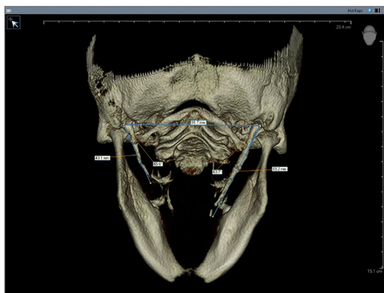
Figure 2 The measurement of the angle between the line connecting the base of the both styloid processes and the axis of the styloid process.

The types of SP and the patterns of calcification stratified according to gender are listed in Table 1. Type 2 was the most frequent type of SP encountered irrespective of laterality (212/416). The most frequent pattern of