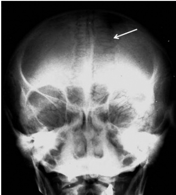
Fig. 5. Skull radiograph showing very marked persistence of Wormian bones in the cranial sutures (arrow).

hypoplastic or absent; these anomalies are usually bilateral but not symmetric. Other skeletal abnormalities include a wide pubic symphysis, dysplastic scapulae, coxa vara, and a variety of vertebral anomalies. These changes are variable and frequently clinically insignificant.