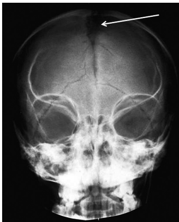
Fig. 4. Antero-posterior skull radiograph showing patency of the anterior fontanelle (arrow).

of the upper respiratory tract owing to maldevelopment of the sinuses, with a potential for hearing loss consequent upon chronic otitis media. 25 Despite these problems, CCD is very variable and often comparatively mild; apart from dental complications, affected persons usually have little disability.