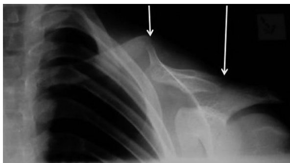
Fig. 2. Radiographically, clavicular hypoplasia and abnormal morphology are evident (arrows).

upper forehead. Hypertelorism and a pointed jaw are other features that contribute to a characteristic facial appearance.