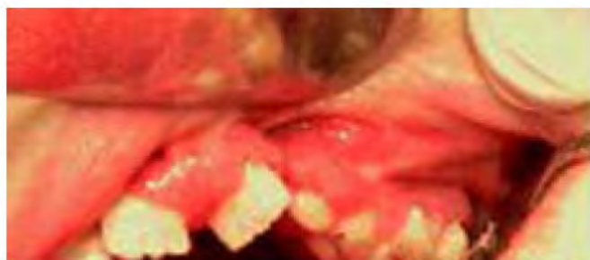
Fig. (2). Sequela of cleft upper lip cicatrisation.

The complete lack of patient's cooperation made the intra- oral examination extremely tough to perform. An examination of the patient's face evidenced prognathism of the lower jaw, labial incompetence with sequela of cleft upper lip cicatrisation, a significant anterior open-bite, hypertelorism, snub nose, low-set hairline, low-set ears with flattened and slightly pointed helixes, and prominent antitragi with wide and stubby lobules (Figs. 1-2).