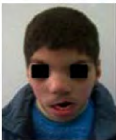
Fig. (1). Frontal view of the patient.

The patient, male aged 12-year-olds, arrived at the Dental Clinic of the University of Sassari taken by his mother. She reported that, the children experienced discomfort when ingesting food and liquids, and that he had several caries lesions. The medical history of the patients pointed out a complex clinical picture. Moreover, the young patient was completely uncooperative and persisted on keeping his mp3 headphones on; his mother indicated this was the only way to “keep him quiet and calm”.