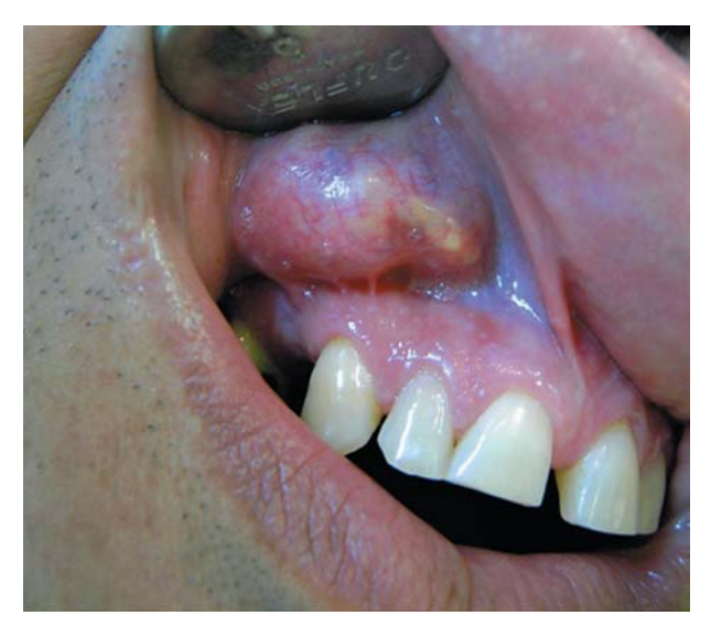
Figure 1- Intraoral photograph at initial examination showing well circumscribed and sessile nodule in the right upper vestibule, measuring 2.0 cm in diameter and with a normal-appearing oral mucosa surface

Hematoxylin and eosin (H&E)-stained sections revealed a well circumscribed encapsulated lesion composed of multiple squamous epithelium-lined