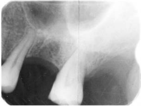
Figure 1 Periapical radiograph demonstrating the upper left quadrant with no signs of odontogenic pathology related to the second permanent molar.

A periapical radiograph was taken (Fig. 1)