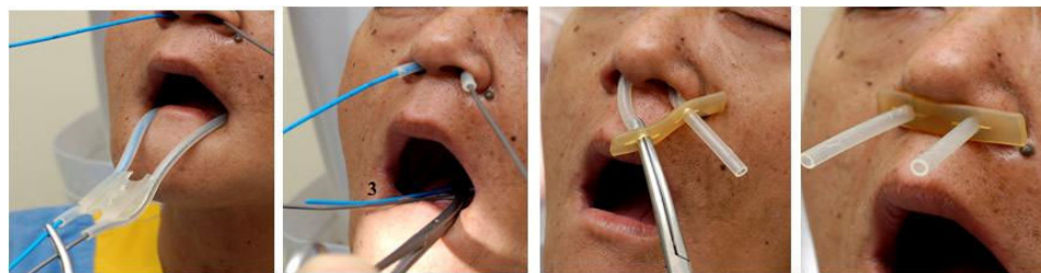
Figure 3 Volunteer with Nasopharyngeal Applicator.

the same cell line inducing phototoxicity with sulfonamide derivatives of porphycene with successful results. Betz [34] et al obtained good results in their in vitro study with amore conventional photosensitizer: 5-aminolevulinic acid.