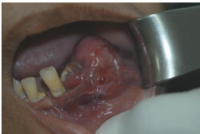
Figure 1. Swelling of the left gingival area. An intra-oral photograph showing the metastatic lesion at gingiva of the left mandibular premolar and molar area.

Subsequent coronal CT scan of the neck was done showing a mass in the right thyroid region. Chest radiograph and